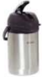
AIRPOT, 2.5L SST LA SINGLE PK