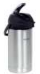
AIRPOT, 3.8L SST LA SINGLE PK