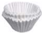
FILTERS,REGULAR1M 500/2 50/CL