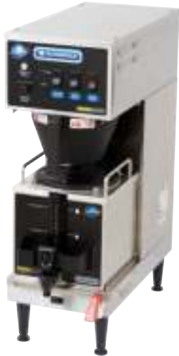
Model 9121 (Includes one (1) Satellite Dispenser) Shown with drip tray - sold separately