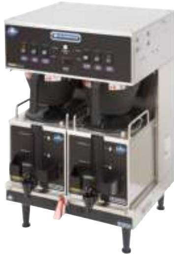
Model 9221 (Includes two (2) Satellite Dispensers)