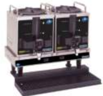
MODEL 9442 Warmer shown with optional Drip Tray (Satellite dispensers sold separately)