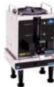
MODEL 9441 Warmer (Satellite dispenser sold separately)

*CE models have one year parts warranty only